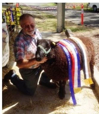
Photos taken at Castle Hill show