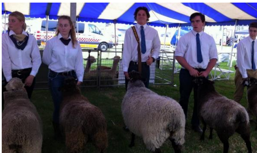
Photos taken at Camden Show.