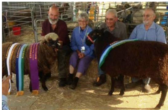
Photos taken at Hawkesbury Show.