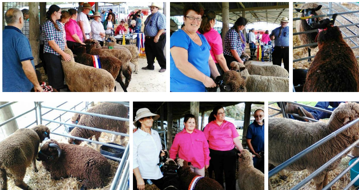
Photos taken at Bungendore Show.