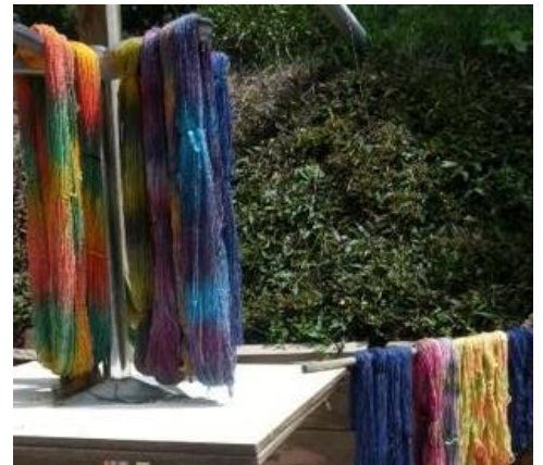
Left Photo: Dyed skeins (Left to Right): Alum, copper, chrome, iron, vinegar and no mordant.