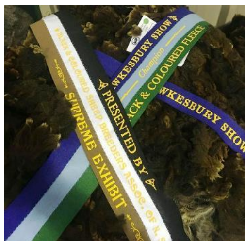
Photos taken at Hawkesbury Show