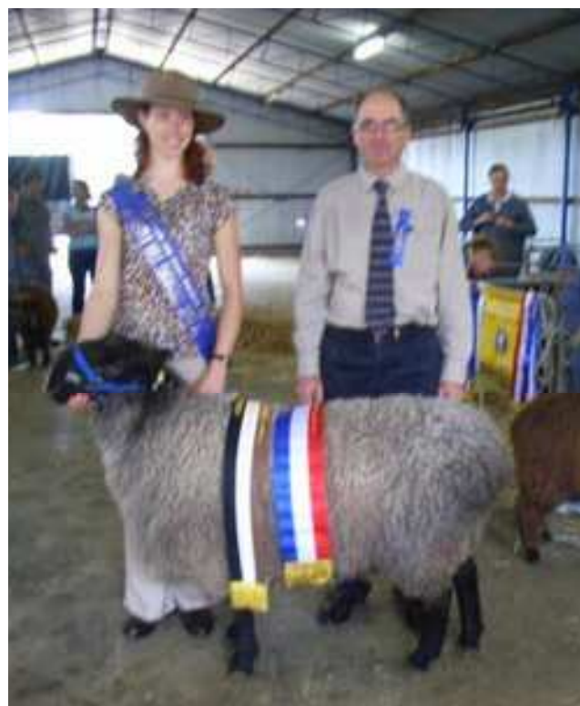
Delco Crossfire Supreme Exhibit at Castle Hill Show 18 March 2007.