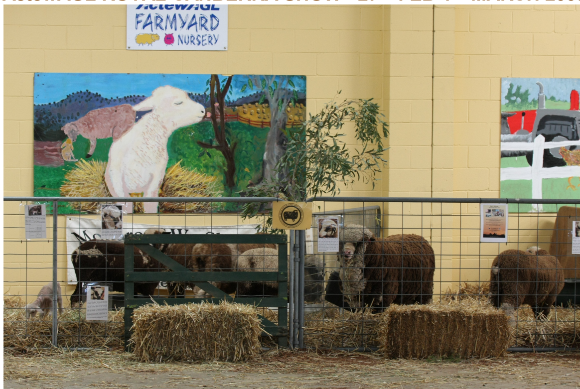
Display of Black and Coloured sheep in the popular Animal Nursery, Canberra Royal Show.