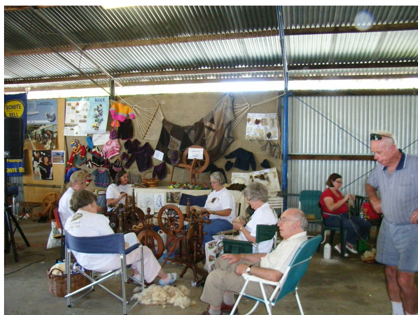
Hawkesbury Region's Mini Back-to-Back competition at Castle Hill Show