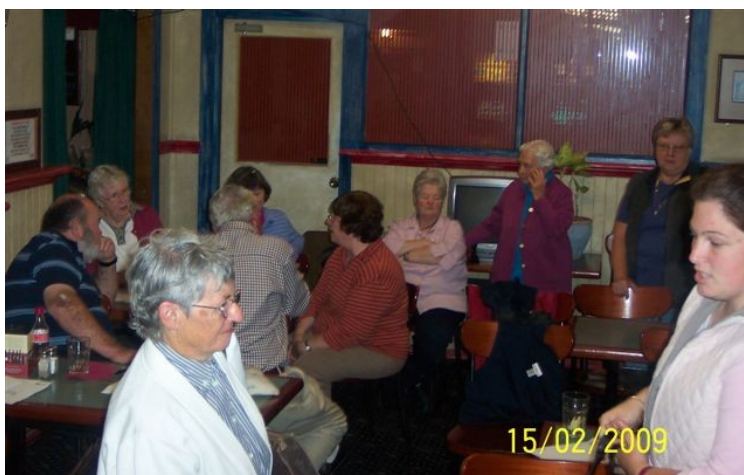
A pause for discussion during the State meetings held in Mudgee.