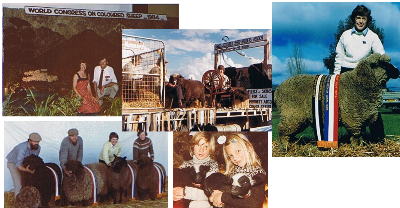
Photographs (from top left, clockwise):